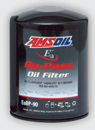
EaBP90 • EaBP100 • EaBP110 • EaBP120

AMSOIL Ea Bypass Oil Filters provide maximum filtration protection against wear and oil contamination. Working in conjunction with the engine's full-flow oil filter, AMSOIL Ea Bypass Filters operate by filtering oil on a "partial-flow" basis. They draw approximately 10 percent of the oil sump's capacity at any one time and trap the extremely small, wear-causing contaminants that full-flow filters can't remove. AMSOIL Ea Bypass Filters typically filter all of the oil in the system several times an hour, so the engine continuously receives analytically clean oil.