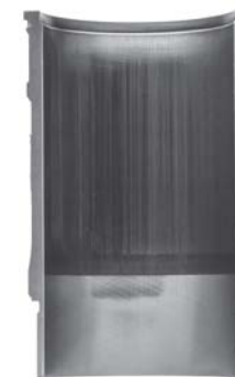
Severely Scuffed Liner